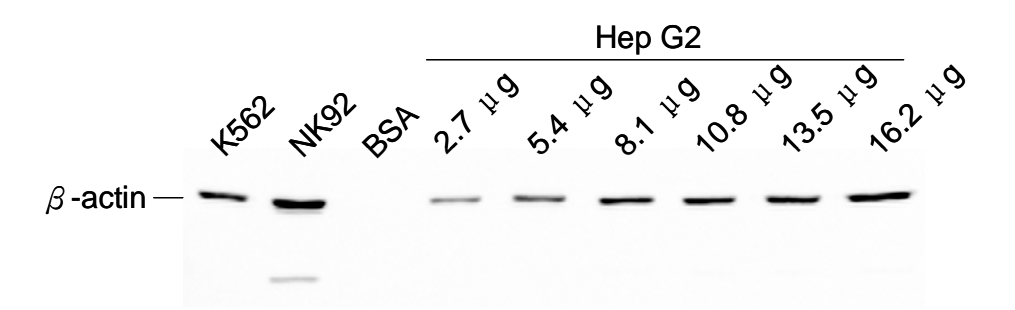
Figure 1. \beta -actin series dilution in Hep G2 cell line. K562 loading 15µg and NK92 cell lysate serve as a positive control. BSA is a negative control.